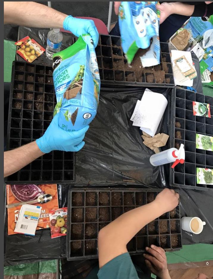
Seed Planting Workshop (Drop In Event)

We also thank staff, volunteers, placement students and board members active in 2016.